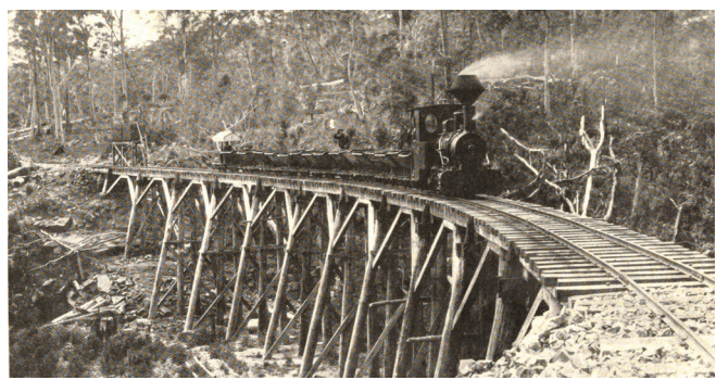
Note: Can be combined with Nierinna Creek Track (23) by walking down Lawless Road, and then Margate Rivulet Track (24)