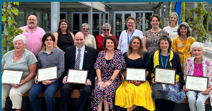
The Kingborough Community Awards recipients