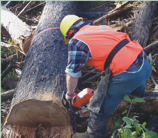
Felling smaller trees for firewood