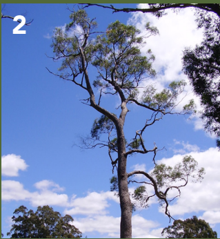
2 A mature tree has a large healthy canopy, foraging habitat for nectar and insect feeders, shelter and roosting sites.