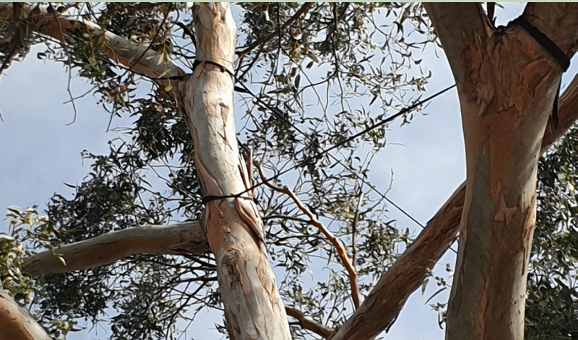
Cabling branches

Fell smaller trees for firewood instead of older, larger trees. This will reduce the risk of accidentally felling a hollow-bearing tree. Cut wood green and store until it is dry. 'Stags' (dead standing trees) and logs on the ground are very important; avoiding these is a more responsible way to harvest firewood.