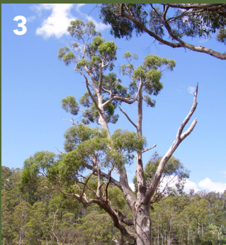
3 An over-mature tree begins to senesce (drop branches) and provides more complex habitat.