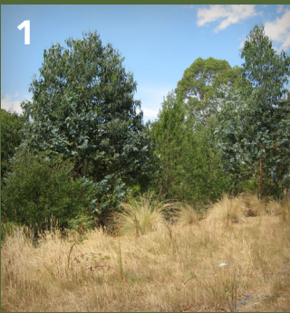
1 Small saplings form part of the understorey. New growth can provide forage for browsing mammals.

As trees age their form changes and with this their potential for developing hollows and providing other habitat. A mature tree can have many habitat values including good foraging material (food), protection from predators, shelter from the elements, and good breeding habitat in the form of nest sites and hollows.