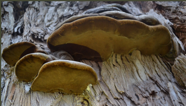
Fungi is one of the main drivers for hollow development in Tasmania but it is an extremely slow process.

Hollows are created over very long periods of time through environmental processes. Hollow development starts with damage to the tree. This can be caused by fire, dropping branches, animals or some other physical damage. These areas provide entry points for fungi which leads to decay and further hollowing out. Insects, such as ants, also contribute to the process. Although fire can help create and enlarge hollows, it can also destroy hollow-bearing trees.