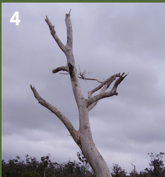
4 Dead trees/stags often contain hollows. They are essential for raptors and pouncing birds and provide habitat for insects. These trees however will not last in the long term.